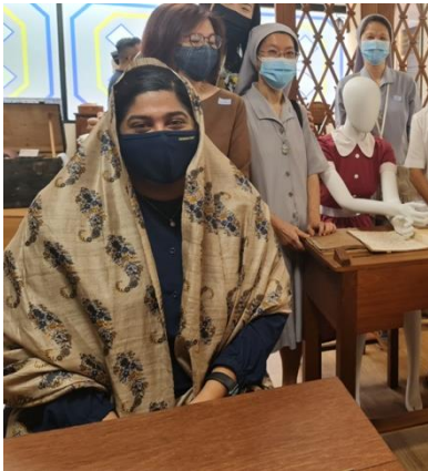
A chance to experience the unique tables of the old school