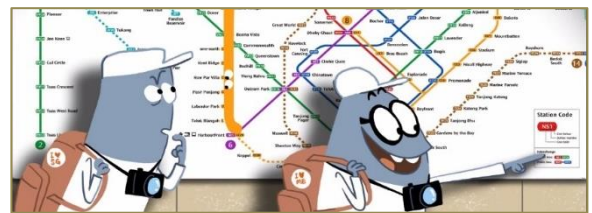
Lamput won the Asian Academy Creative Awards 2020 for Best Children's Programme