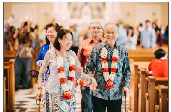
At her 60th wedding anniversary in 2017