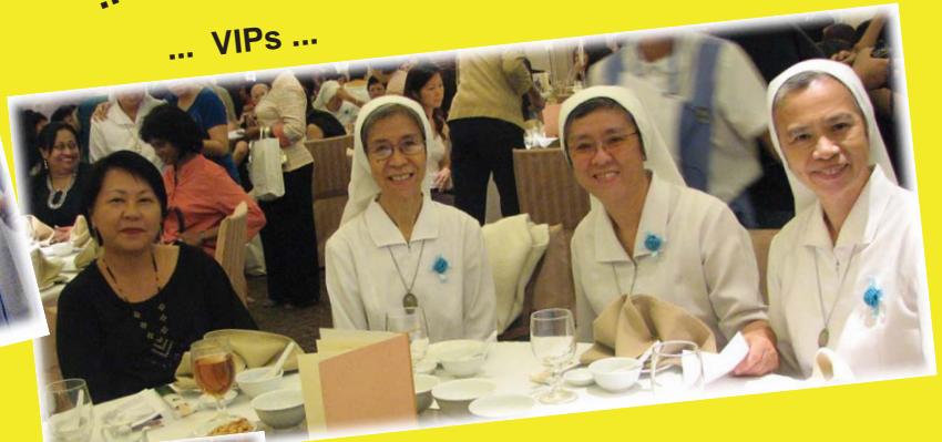
... VIPs ...