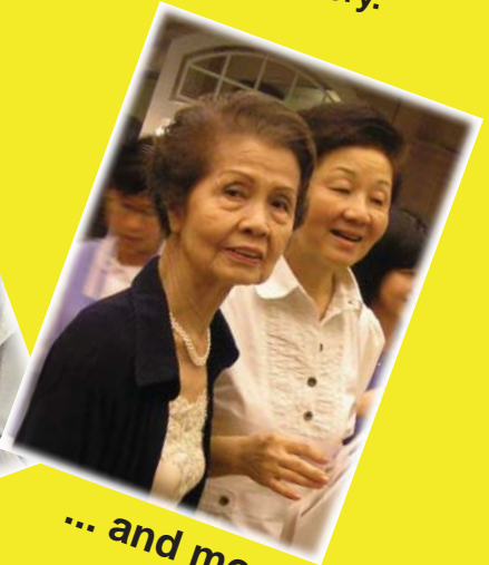
... and more smiles.