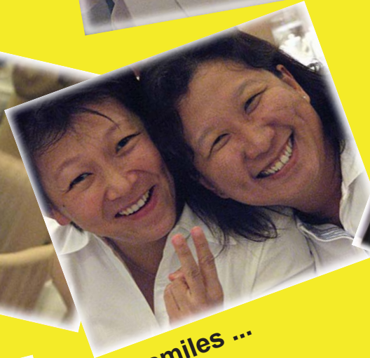
... smiles ...