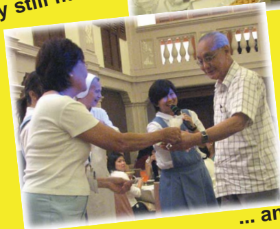
... and the man does get it!